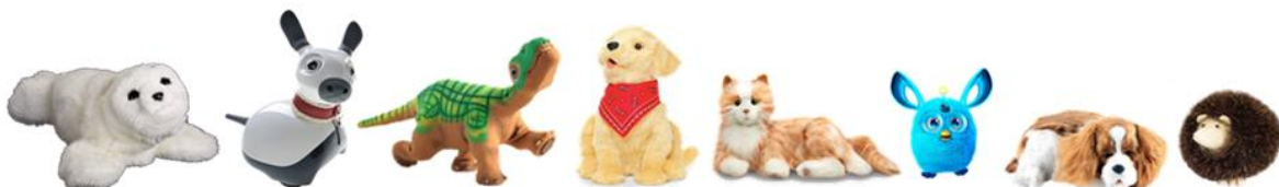
Fig 1. Eight robot and toy animals used in stage one

A range of robots and alternatives were used (Fig 1).