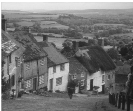
(a) The original goldhill image

Where \mu denoted to the mean of the (m, n) window. \sigma are indicated to the standard deviation of (m, n) window. Figure 3, Figure 4 and Figure 5 illustrated the effect of the proposed method on 512x512 Goldhill, Boat and Lena images when hiding a secret text with size 4900, 14700 and 24500 bits, respectively.