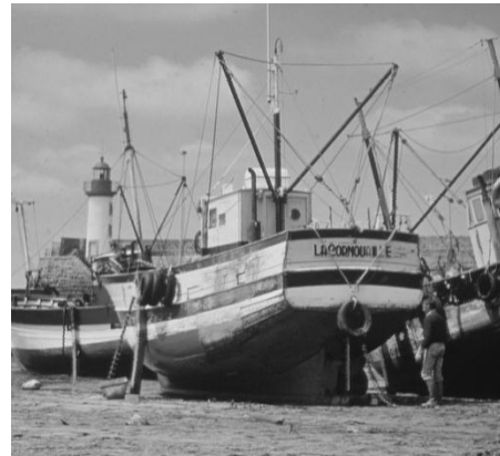
(b) The stego image