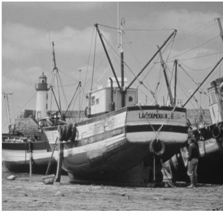
(a) The original boat image