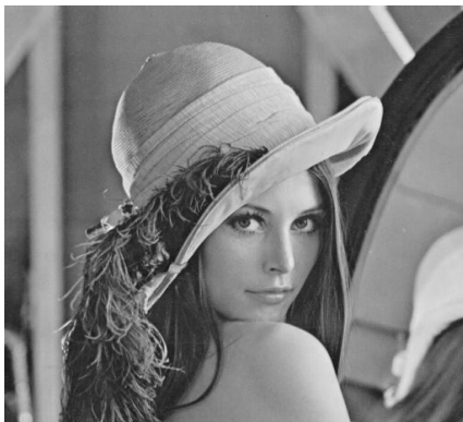
(a) The original lina image