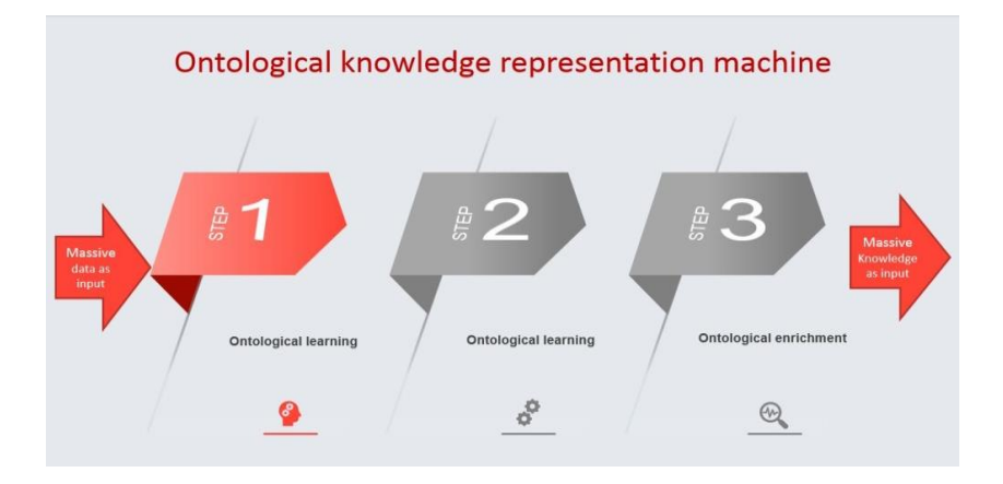
Figure 1. The methodology adopted for ontological knowledge representation in MOOCs

In order to achieve our main objective, which has already been laid out above, and which revolves around the representation of massive knowledge produced by learning actors, the present work adopts the methodology presented in Figure 1.