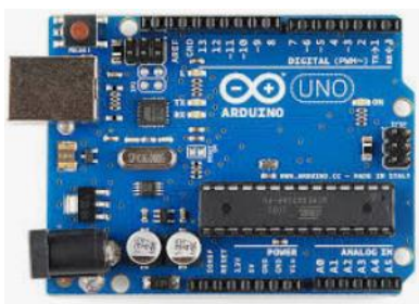
Figure 7. Aurdino microcontroller

It is a credit card sized minicomputer. It is a series of small single board computers, the block diagram shown in Figure 8. There are many generations of Raspberry Pi. Each generation has its own specifications. Latest version is Raspberry Pi module 3. It has on-board WI-FI/Bluetooth support. Processor speed is more than any other microcontroller. It is uses programming language python.