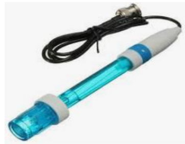
Figure 5. pH sensor