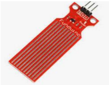
Figure 4. Water level sensor