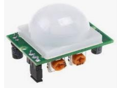
Figure 3. PIR sensor