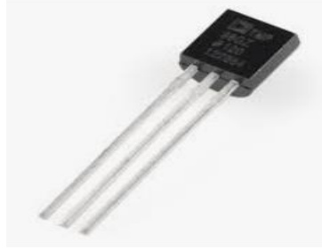
Figure 2. Temperature sensor