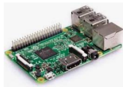
Figure 8. Raspberry Pi microcontroller