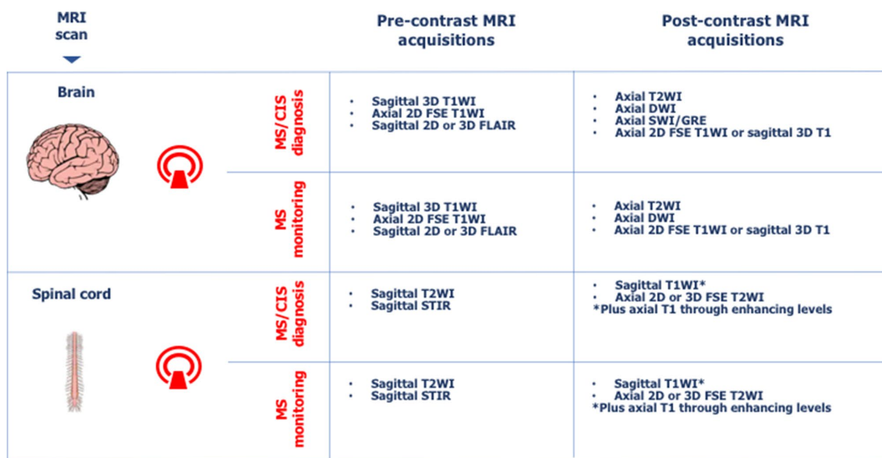
Fig. 2 Suggested MRI acquisitions for MS diagnosis and monitoring. 3D acquisitions should be preferred as they make head positioning less critical, since readers can electronically re-slice the acquired image. DIS dissemination in space, DIT dissemination in time, MRI magnetic resonance imaging, MS multiple sclerosis, CIS clinically

isolated syndrome, 2D 2 dimensional, 3D 3 dimensional, T1WI T1-weighted imaging, T2WI T2-weighted imaging, FLAIR fluid-attenuated inversion recovery, STIR short-TI inversion recovery, DWI diffusion-weighted imaging, SWI susceptibility-weighted imaging, GRE gradient recalled echo, FSE fast spin echo