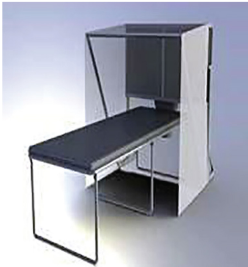
Figure 1 Ventilating headboard. The ventilated headboard consists of lightweight, sturdy and adjustable aluminium framing with a retractable plastic canopy. It is fitted with a high-efficiency particulate air fan/filter unit for filtration (adapted from Mead 48 ).

viruses at homes and in the healthcare settings in LMICs. Moreover, HCWs in LMICs face other challenges that limit optimum infection control including shortage of good quality PPE, variable knowledge on the appropriate use and maintenance of PPE, rapidly evolving policies and lack of proper infrastructure. 50 In the context of the global COVID-19 pandemic, it is essential to conduct further operational research to develop robust evidence to support decision-making and planning by healthcare managers, clinicians and the wider population. Several research questions that could inform policy-makers include: (1) What are the rates of infection transmission in settings with suboptimal versus optimal ventilation? (2) Is the adoption of the hybrid approach effective in reducing the transmission of infections in LMICs? (3) What can be done to maintain thermal comfort in hospital units and makeshift tents without increasing the risk of the transmission of infection? The design of these research projects would benefit from multidisciplinary teams including architects, surveyors, engineers, IPC practitioners and clinicians.