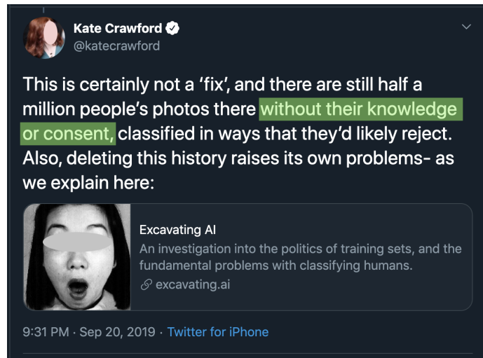
Figure 3: An astonishing tweet.

Kate Crawford has tweeted about the lack of informed consent for the use of private images in scraped training sets (see Figure 3). Remarkably, however, Crawford does not seem to have noticed that she did not have the informed consent of the woman whose face she was tweeting. The irony is distinct—this JAFFE image was used, without permission or informed consent, as the icon for the EAI web page: it was embedded automatically with every post of the EAI site to social media. In effect, the EAI site acted as a machine that caused anyone who shared it on social media to unwittingly breach informed consent and the JAFFE terms of use. 12