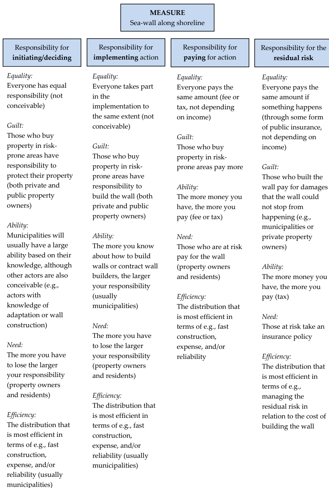
Figure 2. Example of the analysis of the possible responsibility distribution based on the five normative principles.