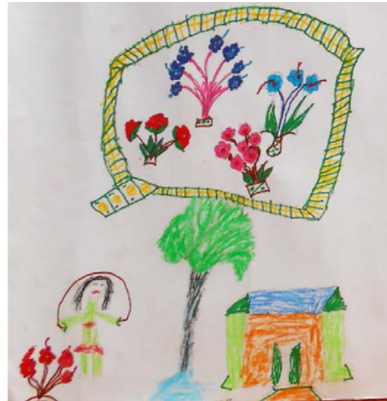
Figure 3: A child's drawing of the school ground having a fenced flower garden

Girl 4: I think so. We can learn how to grow plants and take care of plants.