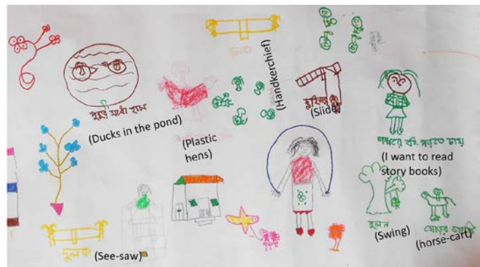
Figure 2: A drawing showing children exploring natural and manufactured play elements and engaged in solitary play or in groups

Science teacher: Children themselves can put fish and plants into water and observe how fish live in water.