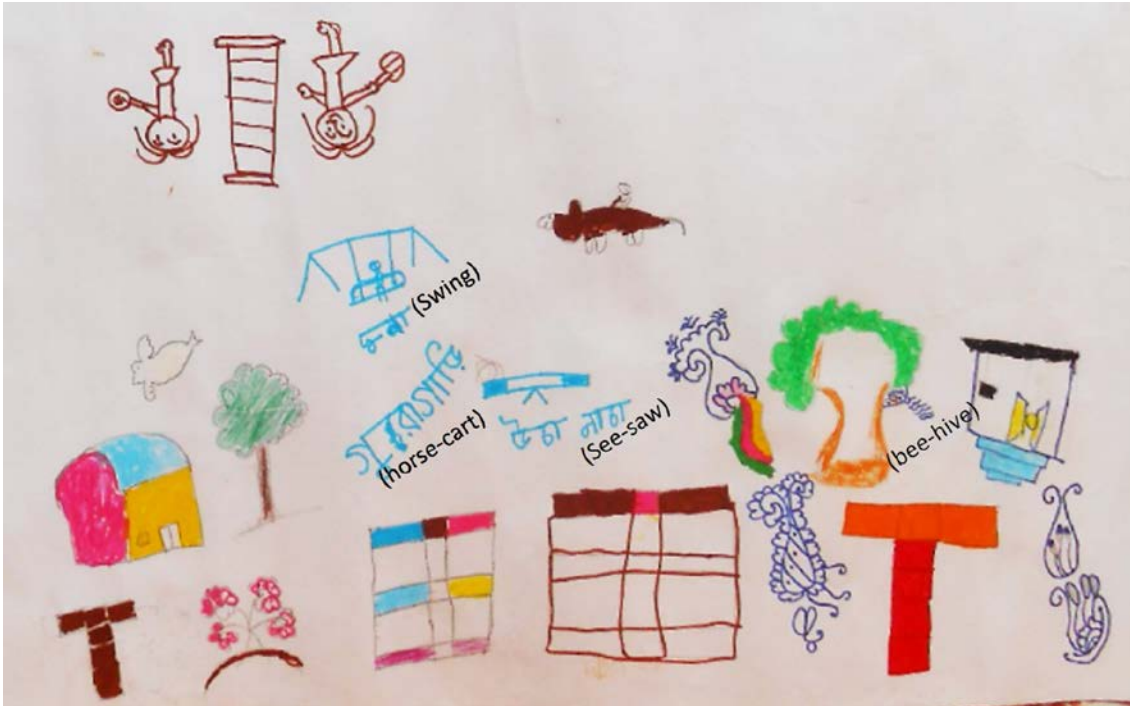
Figure 1: Children's drawing of the school ground showing interdependence of plants and animals

Further aspects of the natural environment were rivers or ponds with fish, boats and water lilies. 8% of the drawn elements were water bodies to explore and enjoy: 'I want to play with fish and ducks in the water' (Girl 2) (see Figure 2). According to the teachers, a waterbody in the schoolyard would not only be enjoyable and entertaining, but also educational. It has the potential to teach children about the flow of water and the water cycle.