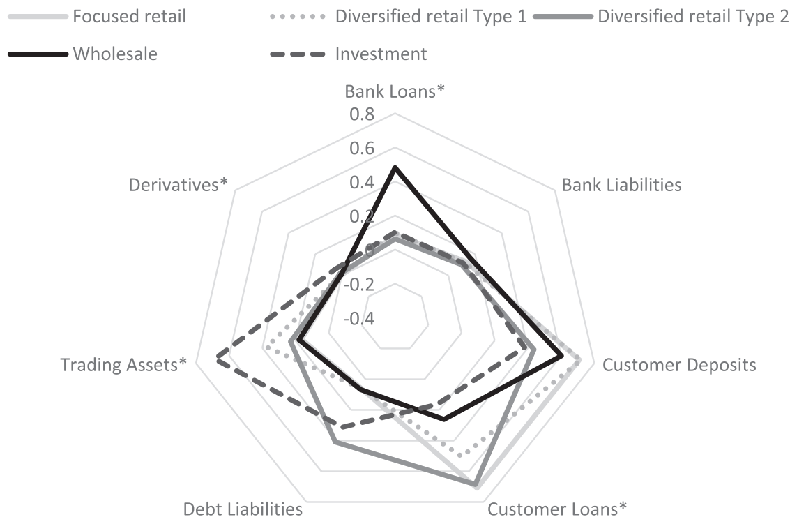
Figure 1. Bank business model definition

Note: The figure shows the differences in terms of bank assets and liabilities in the five BMs identified. The items with an asterisk are those used in the cluster analysis to define the number of clusters. Focused retail, diversified retail (type 1 and type 2) are those BMs that are more retail-oriented, which differ on the diversification of the asset and liability sides. The wholesale BM groups banks oriented to the interbank market and the investment BM groups those banks more oriented to trading activities.