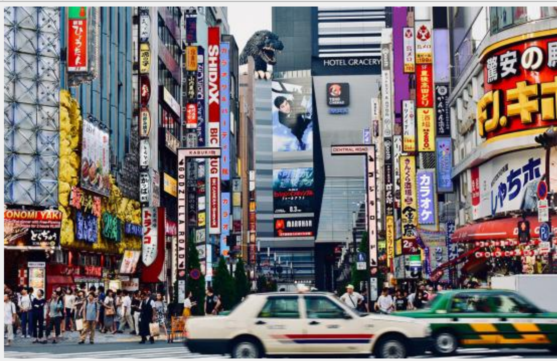
Shinjuku, Tokyo: host of the 2020 Olympics