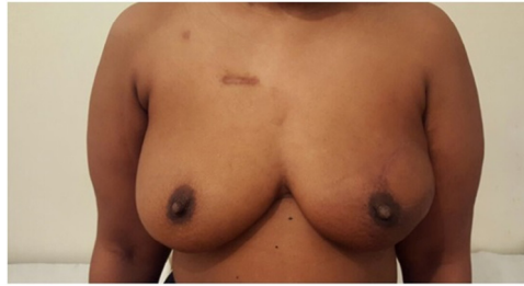
Figure 3. Favorable outcome in a patient with BMI 32 and cup C.