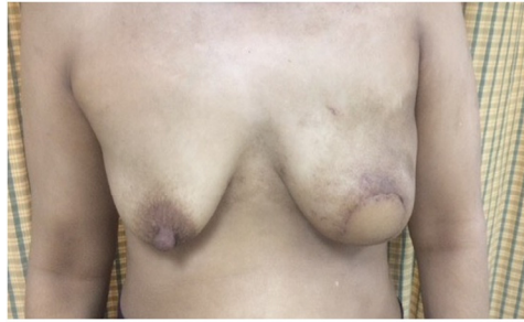
Figure 1. Favorable outcome in a patient with BMI 27 and cup A.