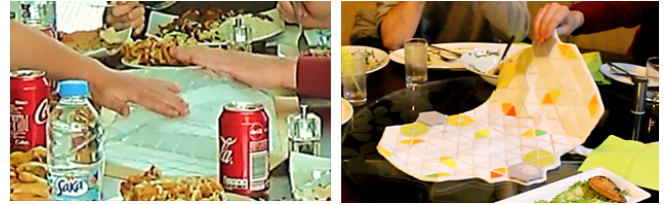
Figure 4. Interactions with ActuEater1 (left) and ActuEater2 (right)

by all groups when proximity-sensing was realized. Some covered up thermochromic parts with both hands to ‘feel the heat’. Some lent forward or backwards in their seats to test proximity. Some repositioned physical objects (that were initially placed randomly) precisely on particular parts of ActuEater2 to test them. Many were observed ‘tracing’ the colour-changing pattern with one finger in a continuous satisfying way.