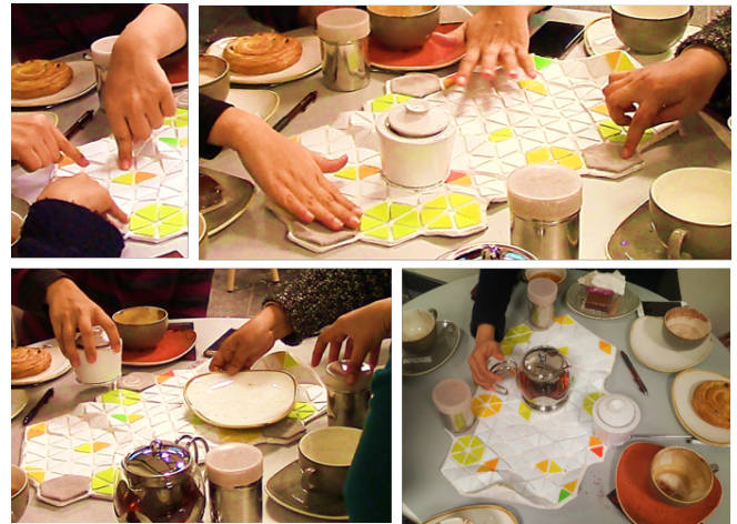
Figure 1. ActuEating: participants curiously exploring ActuEater2

DOI: https://doi.org/10.1145/3196709.3196761