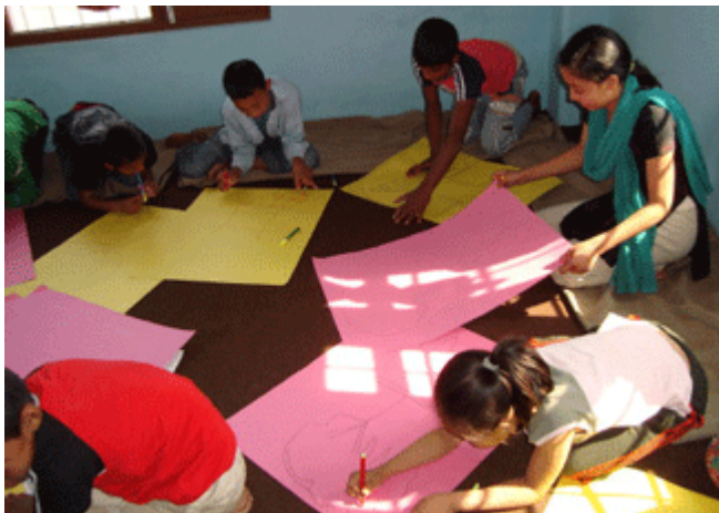
Part 2: Forest of Life