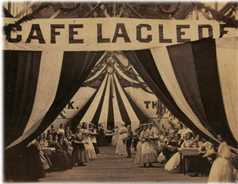
Figure 5: The Café Laclede 16

After two failed votes to ban selling alcohol, General Rosecrans finally ended up issuing General Orders No. 6 that prohibited alcohol only within five blocks of the fairgrounds.