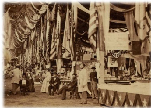
Figure 3: The Mississippi Valley Sanitary Fair 6