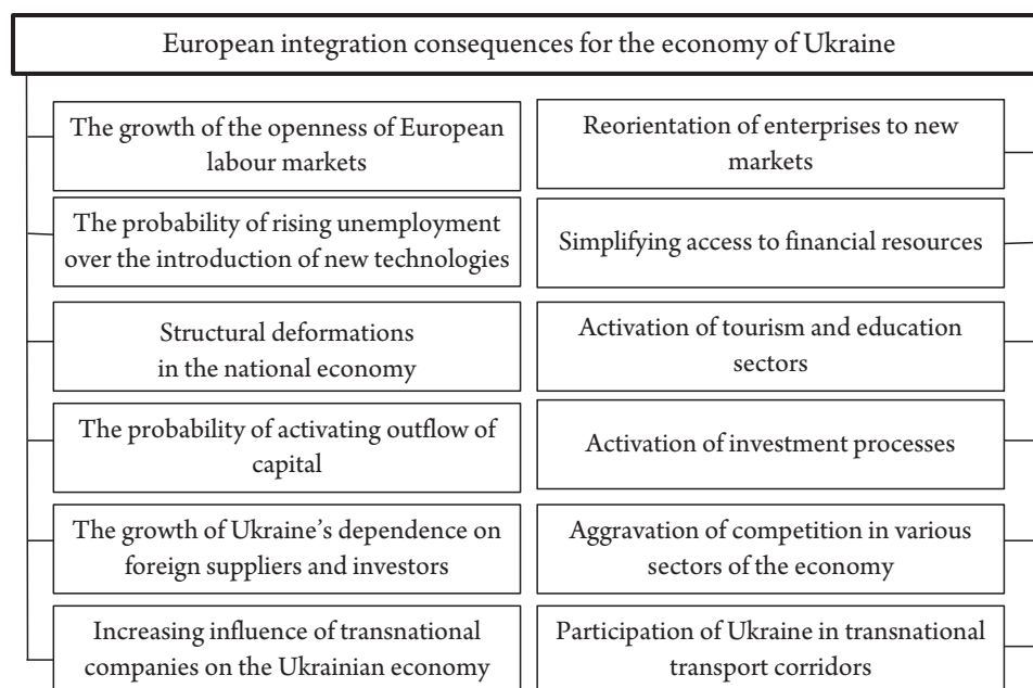
Fig. 2. Determining the consequences of European integration for the Ukrainian economy

The choice of the latter criterion is determined by the fact that the consequences of European integration are not immediately evident. Thus, it is expedient to