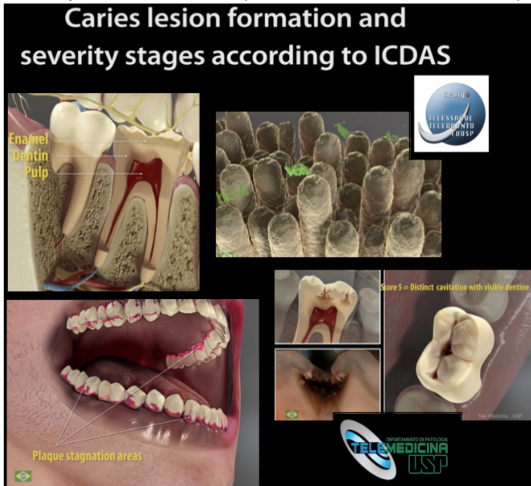
Figure 2. Scenes of the video produced at the Virtual Man Laboratory. ICDAS: International Caries Detection and Assessment System.

after the team's approval, this video was rendered and textured. To achieve this, an image synthesis process was performed to generate photorealistic images (geometry, viewpoint, texture, lighting, shading, etc.) from the developed 3D models using computer programs. By this process, a silent 6-minute video was created using the Virtual Man Project (Figure 2).