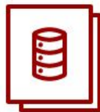
Data Management Plans