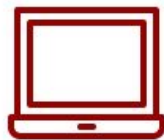
Electronic Lab Notebook