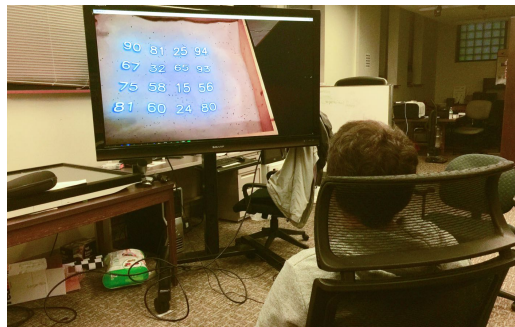
Figure 2: Study participant trying to find matching numbers in video.

compared to unstabilized visualization and to ground truth (perfectly stable) visualization, in the context of a number matching task. The workspace is a sandbox onto which an overhead projector displays a 4 by 4 matrix of two digit numbers. The workspace video is acquired by an experimenter who walks around the sandbox, wearing an AR HMD that has a built-in camera (Fig. 1). The ground truth video is acquired with the AR HMD on a tripod. The participant sits in a chair and watches the video on a monitor (Fig. 2) and tries to find matching numbers.