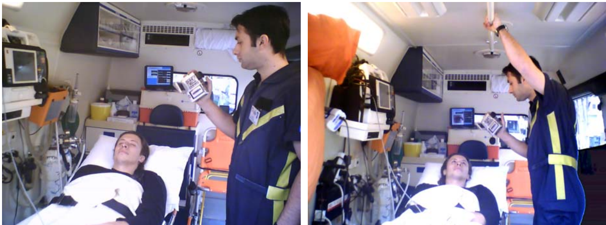
Fig. 2 Operation of the system: the camera is transmitting video to the laptop computer that in its turn uses the PCMCIA card to transmit through a 3G link.

As there had to be some kind of network performance indicator, on the mobile side of the system, two network monitoring programmes were running continuously: one was provided with the PCMCIA card and indicated the network connection (UMTS or 3G) and the speed connected, while the other displayed information on channel utilisation, packet size, protocol usage and specific speed on every instant.