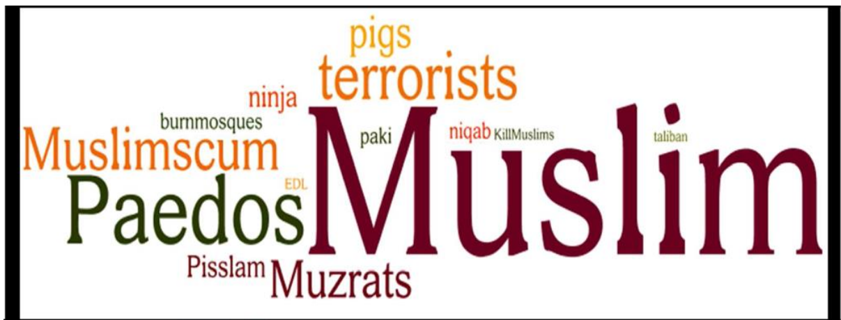
Figure 3. Word Cloud of Most Frequent Posts of Anti-Muslim Prejudice From Twitter. Awan: Islamophobia and Twitter 141