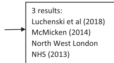
Figure 1. Search process for review.

who were homeless using neuropsychological tests or screening tests. This showed that verbal memory (as well as attention and speed of processing) was lower in the group that were homeless compared with the normative population. For example, Bremner et al. (1996) found 80% of the sample studied achieved scores at the ≤50th percentile on the Adult Memory Information and Processing Battery—this is significantly below the performance expected in the general population. The authors concluded that verbal memory deficits may be a risk factor for causing and maintaining homelessness and negatively impact on the effectiveness of care, support and treatment programmes. The authors did find in one study (Gonzalez et al. 2001) that language