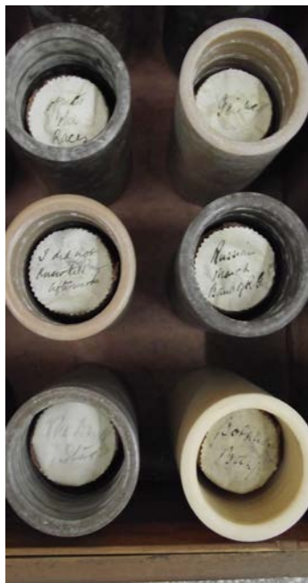
I did not know till afterwards , an installation by Holly Pester at Text Festival, 2011