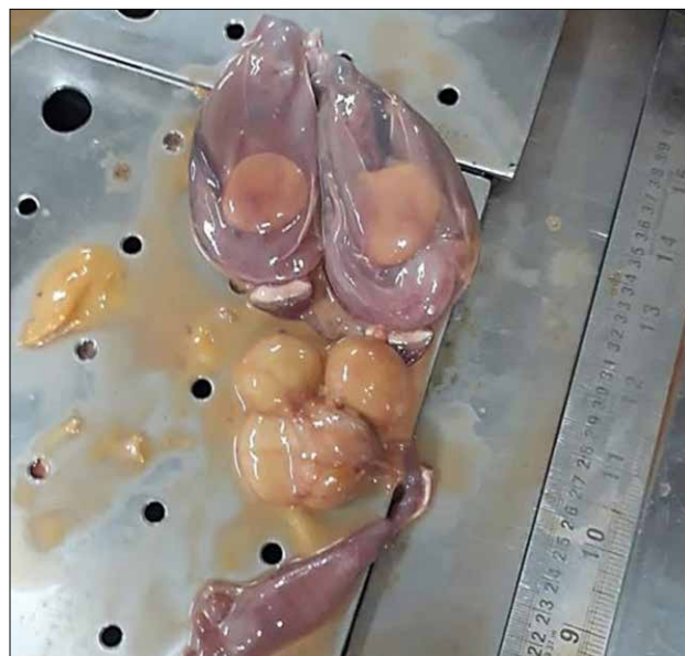
Fig. 3. Ova and uteri of A. variegatus

shriveled yolk sacs were of larger size (175.6 and 175.9 mm TL) and were possibly full-term embryos that have already utilized the nutrient-rich yolk and was about to eclose (emerge). The stomachs of each were distended with yolk. Thus the embryos were exclusively yolk reliant and developed inside the uteri. Yolk sacs of the embryos measured 26.77-33.40 mm in diameter and the cord lengths ranged from 25.03 to 32.83 mm. Out of the five embryos, four were male with the external edge length of claspers varying between 6 and 8 mm (Fig. 4) and the remaining one was female; the embryonic sex ratio (M:F) observed was thus, 4:1 (Table 2). Pigmentation on the ventral side of the snout was distinct in the embryos which is