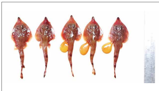
Fig. 2. Embryos recovered from pregnant female