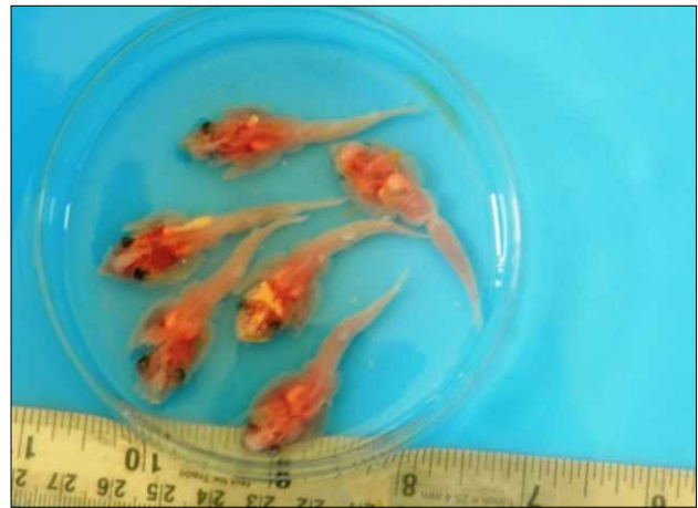
Fig. 7. Recovered embryos of A. variegatus landed at Kanyakumari District, Tamil Nadu

biology. The mode of reproduction in A. variegatus is aplacental yolk sac viviparity with low uterine fecundity. A significant decline of 86% was documented in the collective landings of wedgefishes and guitarfishes from 2002-2007 at a landing site in Tamil Nadu. This specifies a decline of 97% for A. variegatus over the past 15 years. The species' entire distribution range in southern India is subjected to intense fishing pressure with large numbers of trawlers as well as other fishing gears (Jabado et al. , 2017), besides landings as by-catch in several artisanal gears. Knowledge of embryonic development, fecundity, maturity stages and reproduction will be helpful in understanding the resilience competency of the species that could contribute towards the development of appropriate stock management strategies (Sen et al. , 2018). The critically endangered status coupled with evidence of population decline of this endemic species warrants formulation of suitable guidelines for conservation and sustainable exploitation of this resource.