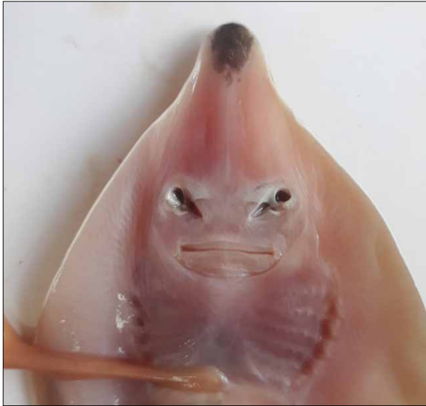
Fig. 5. Distinct pigmentation on the ventral side of snout in embryos

characteristic of the species (Fig. 5). Variegated markings on the pectoral and pelvic fin margins had not yet developed in the embryos. During 2014, in the southern tip of south-west coast of India (west coast of Kanyakumari District, Tamil Nadu) similar incidence of landing of a pregnant A. variegatus (Fig. 6) was observed with six full term embryos (Fig. 7). The size of the gravid female then recorded was bigger than the present report. It measured 732 mm in total length (TL) and weighed 2.2 kg (Santhosh and Ambarish pers. comm.). Data on fecundity is very important to understand the reproductive potential of a particular species or population and also for predicting the future stock size (Figueiredo et al. , 2008). As Kyne and Bennett (2002) stated, the fecundity of shovelnose guitarfish is generally low, which is reliable with the overall condition found in elasmobranchs. Fecundity of A. variegatus collected from Sakthikulangara, Kerala and west coast of Kanyakumari District, Tamil Nadu was similar; five and six respectively.