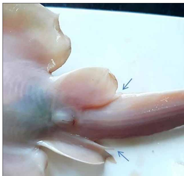
Fig. 4. Closer view of claspers (pointed arrows) in a recovered male embryo

shriveled yolk sacs were of larger size (175.6 and 175.9 mm TL) and were possibly full-term embryos that have already utilized the nutrient-rich yolk and was about to eclose (emerge). The stomachs of each were distended with yolk. Thus the embryos were exclusively yolk reliant and developed inside the uteri. Yolk sacs of the embryos measured 26.77-33.40 mm in diameter and the cord lengths ranged from 25.03 to 32.83 mm. Out of the five embryos, four were male with the external edge length of claspers varying between 6 and 8 mm (Fig. 4) and the remaining one was female; the embryonic sex ratio (M:F) observed was thus, 4:1 (Table 2). Pigmentation on the ventral side of the snout was distinct in the embryos which is