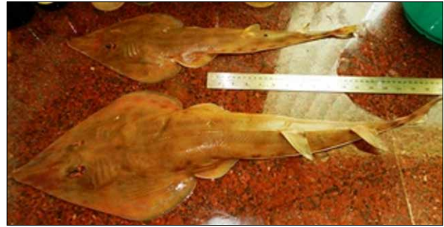
Fig. 6. Pregnant A. variegatus landed on west coast of Kanyakumari District, Tamil Nadu

The biological observations recorded in the present study for the critically endangered and a poorly known guitarfish A. variegatus provides preliminary insights into its reproductive