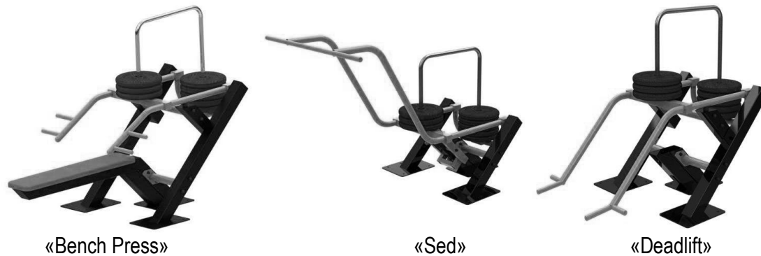
Figure 1. Street exercise simulators with a variable load for powerlifting.

Before the start of the experiment (May 2019) and after the implementation of the study (September 2019), power diagnostics for sports types of powerlifting was implemented. All participants in the study took part in the monitoring. Athletes performed three exercises without equipment: squatting with a barbell on the back (on the upper part of the shoulder blades), a bench press lying on a horizontal bench and a barbell pull. The results in total determined the sportsman's athletic level. To summarize, the average powerlifter coefficient (PI) was applied in each study group of athletes. Prior to the implementation of the study (May 2019), a statistical analysis of the data revealed an unreliability ( p > .05 ) of the difference between the EG and the CG for both the group of women and the group of men. The results of the experiment are presented in Table 1 for women and in Table 2 for men.