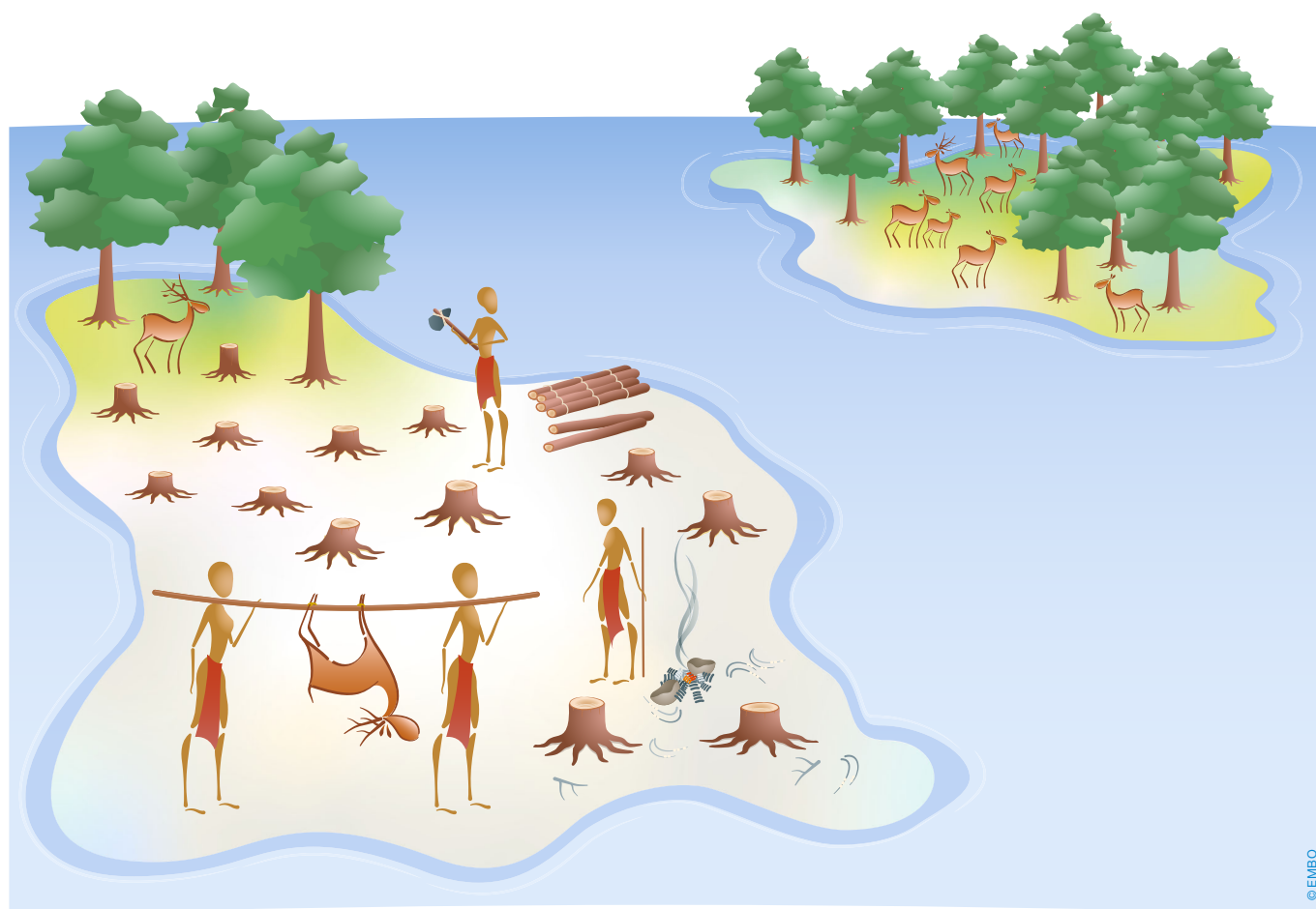
Figure 2. Illustration of a trade-off between exploitation and movement.

instance, during the 1918 H1N1 influenza pandemic, some US cities were spared during the first wave of infection. Those cities, however, suffered higher mortality rates during the second, more severe wave of infection, presumably because people in previously affected cities had acquired immunity a few months earlier. Past pathogen exposures may also shape the host population's ability to resist novel infections. The natural resistance of a small proportion of Europeans to HIV has been hypothesised to be a hand-down from the Black Death in the Medieval Ages: selectively beneficial mutations at that time would now provide some level of cross-immunity to HIV. While this is unlikely to be the case in this particular instance, such cross-protection may, nevertheless, explain why elderly people who would have been exposed to pre-1950 influenza strains were less affected than other age groups