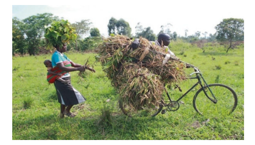
Fig. 5.1 Bean farmers in Masaka District transporting their bean produce to the homestead after harvesting, Uganda