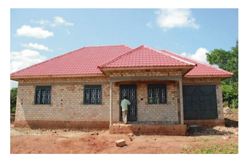
Fig. 5.7 Mr. Lule Daniel in front of his newly constructed house, Uganda

varieties. To enable proper management of the group, farmers have been organised in farmer groups; the cooperative collectively manages 60 farmer groups. Of the 1088 farmers, 400 are focused on seed production and 600 produce beans as grain.