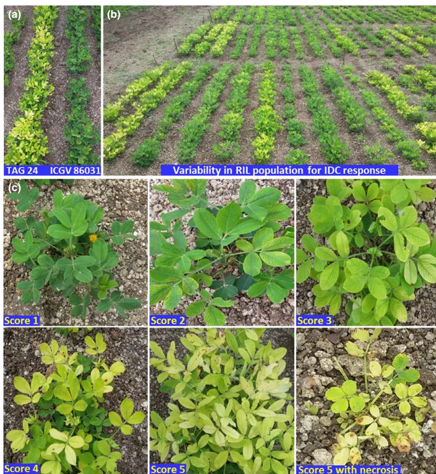
FIGURE 1 Phenotypic variability in parents and RIL population, and visual chlorosis rating (VCR) (1 to 5 scale) for IDC response. The figure indicates the (a) IDC response of parents, (b) variability for IDC response among RILs and (c) representation of VCR scale (1–5) used for assessment of RILs [Colour figure can be viewed at wileyonlinelibrary.com ]

The field experiment was conducted for two consecutive years (2013 and 2014) during rainy season at College of Agriculture, Vijayapur, India (16°49'N, 75°43'E, 593 m above mean sea level, and 597 mm average annual rainfall) on calcareous vertisol soils that are alkaline (pH > 8) and deficient in available Fe (DTPA-extractable Fe < 4 mg/kg; Table S1). Field screening for IDC response of RIL population along with parents (320 lines) was done using randomized complete block design in two replications. Each genotype in a replication was planted as one row of 2.5 m length with an inter- and intrarow spacing of 30 and 10 cm, respectively. The recommended dose of nitrogen (25 kg/ha), phosphorus (75 kg/ha), potassium (25 kg/ha) and zinc sulphate (25 kg/ha) were added to the field at the time of planting. Iron-containing fertilizers were not applied. Recommended cultivation practices were followed to raise a good crop. The range of climatic factors during the crop period (June to October) at Vijayapur in 2013 and 2014, respectively, were as follows: maximum temperature (26.9–32.6°C; 26.6–34.2°C), minimum temperature (20.1–21.8°C; 14.7–21.9°C), average relative humidity (64.1%–85.5%; 57.2%–85.7%) and season rainfall (590 mm in 30 rainy days; 431 mm in 21 rainy days).