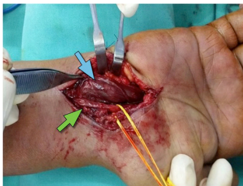
Figure 1: Hypertrophied first lumbrical muscle (blue arrow) and second lumbrical muscle (green arrow) compressing on the median nerve (deep to the lumbrical muscle).

Open carpal tunnel release was performed under general anesthesia in anticipation of exploratory surgery. Intraoperatively, the transverse carpal ligament had no overlying mass or fibrotic thickening. After incising