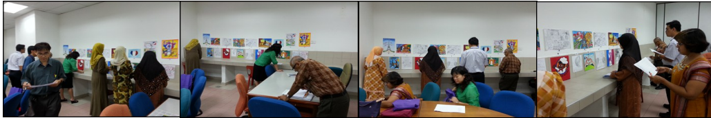
The judges hard at work grading the entries.

Students from Universiti Teknologi MARA Pulau Pinang were recently given the opportunity to take part in a poster drawing competition organized by the French Club of the university. Opened to all, students eagerly picked up their long abandoned colour pencils and crayons to rekindle their passion for drawing. The contest which started on the 13th of January and ended on the 7th of February saw an interesting number of participants. The theme of the competition revolved around the French culture with a slogan in French. A multitude of skills was applied, intense colours splashed and coupled with a vivid imagination, a vibrant and vivid French cultural landscape was aptly portrayed. On the 14 th of February, ten judges from the Academy of Language Studies were invited to choose the winners of the contest. The posters were judged based on five criteria: innovation, imagination, image content, wording and commitment of the participants.