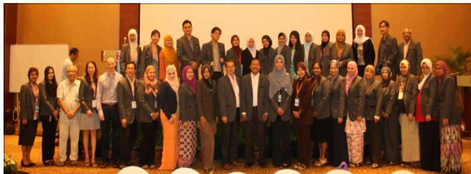
The members of the faculty with some of the conference participants