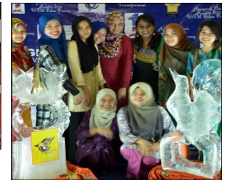
Cheese! ALS faculty members posing at the event.