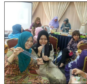
Savouring the delicacies on offer!