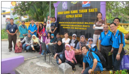
The APB staff at the entrance of the Rumah Kanak-kanak Taman Bakti

A total of 35 staff members of The Academy of Language Studies, UiTM Pulau Pinang participated in a community programme called Program Mesra Ceria Bersama Kanak-kanak Rumah Kanak-kanak Taman Bakti on 22 June 2013. This event took place at a welfare home for the neglected and abused children as young as a newborn to as old as 12 years. 92 children were involved in this programme from 8.00 a.m to 1.00 p.m.