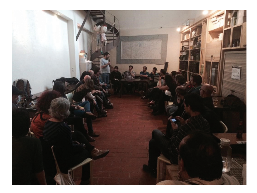
Figure 1. Ateneu La Base (LB).

The rationale for choosing these sites is threefold: their diversity in terms of social class, activism type, neighbourhood, and land property enables a multiperspectival approach, taking into consideration different voices (Snow and Trom 2002); their complexity in terms of projects and number of participants enables analysis of the most elaborated form of the movement's radical imagination; their strong connection to (CB) or direct emergence from (LB, RC) the