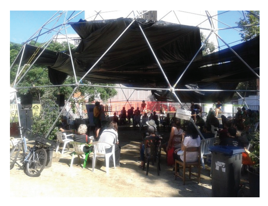
Figure 2. Recreant Cruïlles (RC).