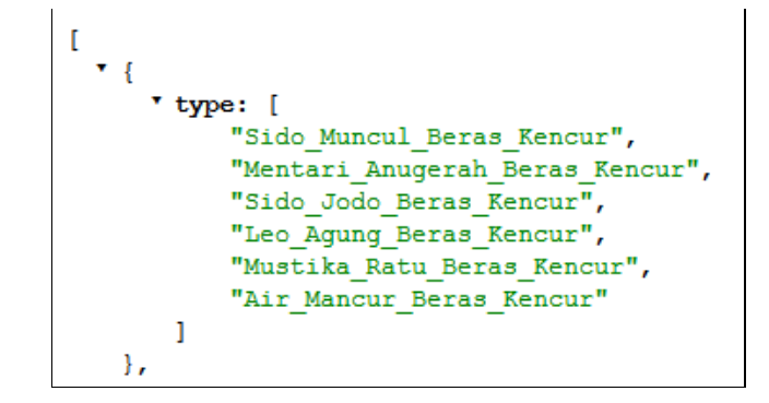
Figure 4. Result Query DL for Jamu Saffron Colored Rice

The rules which have been built can be accessed through the Web page. Web pages are built using Java with JVM 8.0 and IDE Eclipse with Tomcat Web Server 8.0. The reason for using the Java language is Java has a library to query DL, while other languages do not have such capabilities. Example in the case of Jamu as described in the previous section, the result when given the input Jamu Saffron Colored Rice can be seen in Figure 4.