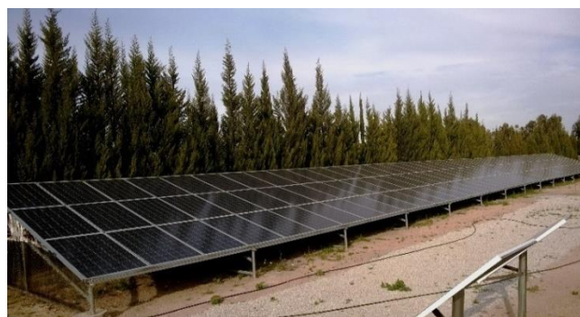
Figure 2. Installed solar panels