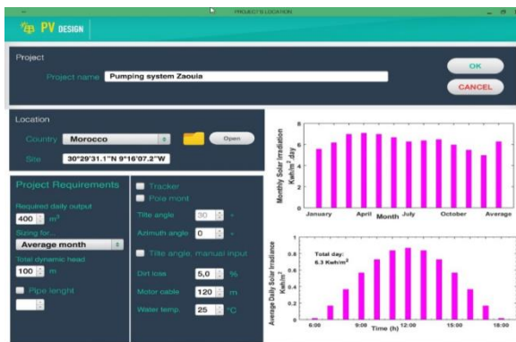
Figure 5. Site selection and performance of the pumping system in PV_{DESIGN}