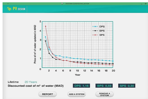
Figure 7. Costs comparison of m^3 of water pumped by BPS , DPS and SPS depending on the number of years of operation.

Figure 7 shows a screenshot of the PV DESIGN application, indicating the results obtained by comparing our studied systems namely BPS , DPS and SPS . These results show that the photovoltaic system has a high price at the beginning compared to other systems. However, it recovers very quickly in less than 2 years compared to the DPS system, and after 5 years, the price of the m^3 of the SPS system becomes much lower than that of the BPS system. This economic study shows that the photovoltaic system is the best solution for our pumping system. Let alone, the classic advantages of solar compared to the other two techniques, namely: respect of the environment, better reliability, repair, limited maintenance and lack of fuel.