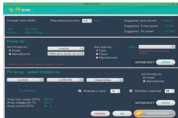
Figure 6. Dimensioning of the pumping system by PV_{DESIGN}