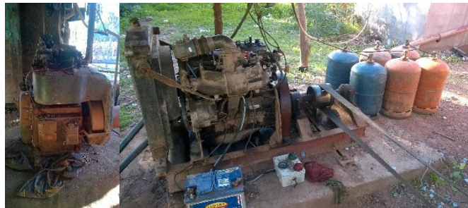
Figure 1. Existing projects, DPS (left) and BPS (right)

Our work is based on the study of an existing butane and diesel pumping station for irrigation in a village known as Zaouia located in the rural commune of Isn, province of Taroudant. This station is composed of a diesel engine (or butane) and centrifugal pumps which flow in a very large basin. Other surface pumps allow the water to be redistributed to the crops through a drip system (Figure 1). Our objective is to transform this traditional solution into an SPS (Figure 2) and, therefore, demonstrate its economic and technical competitiveness compared to traditional solutions beforehand.