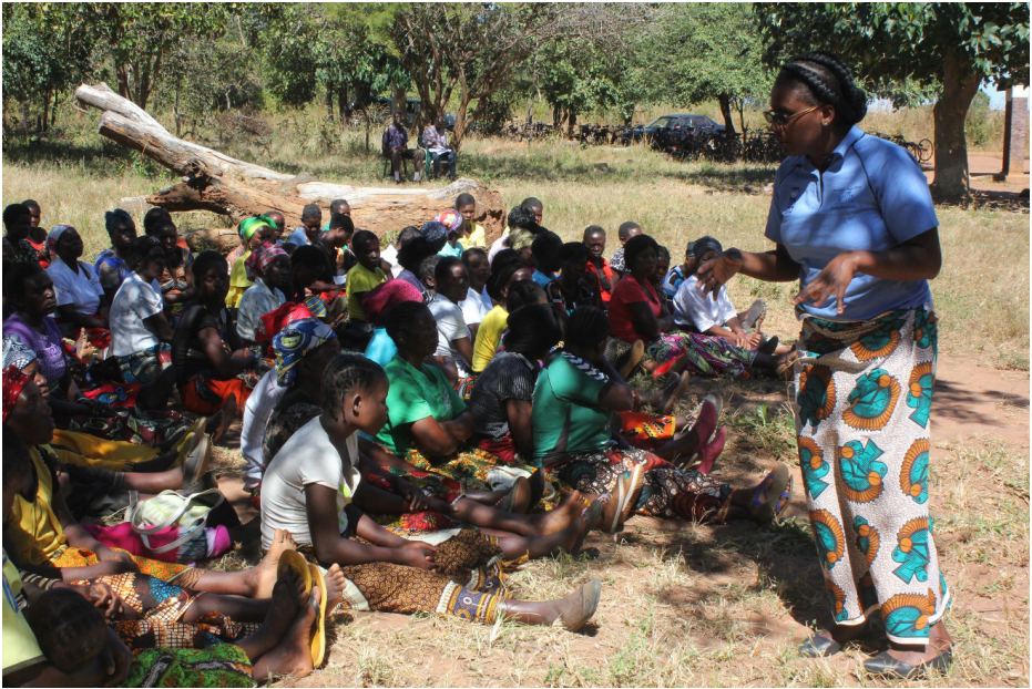
The study revealed that knowledge levels and access to basic information by communities were contributing factors to access and use of CDF financed projects.

The study showed that the level and nature of community-WDC, Councilor or Local Authority relations played a key role in determining access and benefits to CDF funded projects in areas of health, education, water and sanitation. For instance, strong relations were registered in Lukashya and Wusakile Constituencies than in Mongu Central and Livingstone Central.