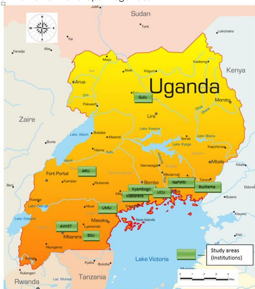
Figure 1: A map of Uganda indicating the areas (institutions) of study - Adopted and modified from "Facts.co" (n.d.)

This article focuses on the usage of TEEAL and AGORA in institutions that have received the TEEAL-AGORA Training-of-the Trainer workshops in Uganda.