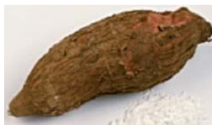
Manioc and tapioca flour

On behalf of the Government of the United Republic of Tanzania, the representative of the Director of plant protection believed in the formulated recommendations which will be relevant and essential to do proper job now and in the future. She finally thanked workshop organizers, participants, IAPSC for their good initiative of having this workshop held in Tanzania and especially in Arusha; and all who made the workshop successful and then declared the official sessions of the workshop closed.