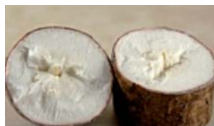
Manioc root, cut pieces