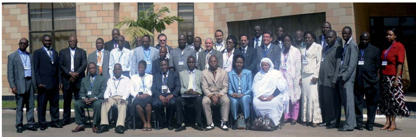
Group photo