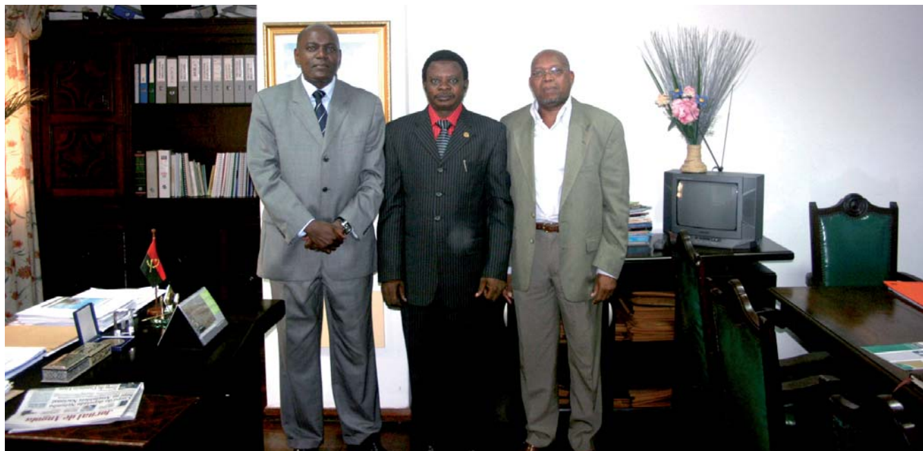
De gauche à droite : le Directeur National de l'Agriculture, des Pêches et des Forêts, le représentant du CPI et le Chef du Département de l'Agriculture et des Forêts.

de contre saison. Les paysans, sans protection appropriée, usent de moyens les plus rudimentaires pour limiter les dégâts. Dans certaines familles, la scolarité des enfants est suspendue dès l'apparition des premiers épis pour qu'ils s'adonnent au gardiennage des champs.