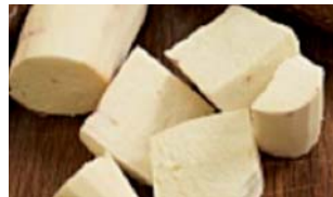
Peeled and Chopped Yuca