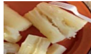
Boiled Yuca on a Plate with a Fork