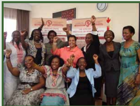
SOAWR members celebrating ratification of the Protocol by Uganda

Association, Femmes Africa Solidarite, African Women's Development and Communication Network (FEMNET), Malian Women Lawyers Association, Senegalese Women Lawyers Association, Women in Law And Development in Africa (WiLDAF), and Women's Rights Advancement and Protection Alternative (WRAPA). This consensus text was based on existing international instruments, such as the Convention on the Elimination of All Forms of Discrimination against Women (CEDAW), but specifically adapted to the African context. The NGO group then advocated for a strong Women's Rights Protocol with governments.