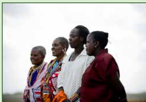
Kenyan Women in Narok , Photo by Des Willie

The Human Rights Committee, in its General Comment No. 3 on equality of rights between men and women, has interpreted compliance with Article 7 (torture or cruel, inhuman and degrading treatment) of the ICCPR as requiring the State to give "access to safe abortion to women who have become pregnant as a result of rape" and "prevent forced abortion and forced sterilization." The Committee went on to state that policies such as those requiring a husband's authorization to make a decision regarding sterilization; mandating sterilization after a certain age or a certain number of children; or "States impose a legal duty upon doctors and other health personnel to report cases of women who have undergone abortion" violate a women's right to privacy under Article 17 of the ICCPR, and may also violate her rights to life under Article 6 and against being subjected to torture or cruel, inhuman and degrading treatment under Article 7 of the ICCPR. The Committee on the Elimination of Discrimination against Women has, in its General Recommendation No. 24 on women and health, identified "laws that criminalize medical procedures only needed by women and that punish women who undergo those procedures" as a barrier to women's right to health.