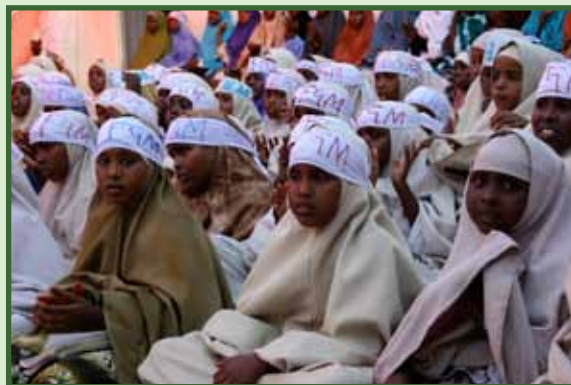
School girls in Galkacyo, Somalia campaigning against FGM

Failure to take comprehensive measures to eliminate female genital mutilation also violates Articles 2(f) (modify or abolish existing laws, regulations, customs and practices which constitute discrimination against women) and 5 (eliminate customary practices which are based on the idea of the inferiority or the superiority of either of the sexes or on stereotyped roles for men and women) of CEDAW; as well as Article 24(3) (abolish traditional practices prejudicial to the health of children) of CRC. The Human Rights Committee, in its General Comment No. 28 on equality of rights between men and women, interpreted compliance with Articles 7 (torture, cruel, inhuman or degrading treatment or punishment) and 24 (special protection for children) to require States to take measures to eliminate female genital mutilation.