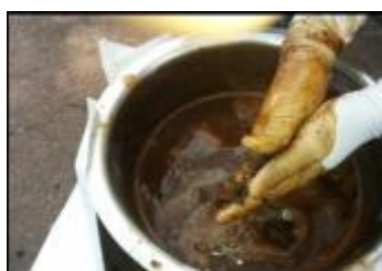
Maceration after 3 hours