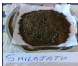
Shilajatu coarse powder