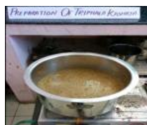
Preparation of Triphala kashaya