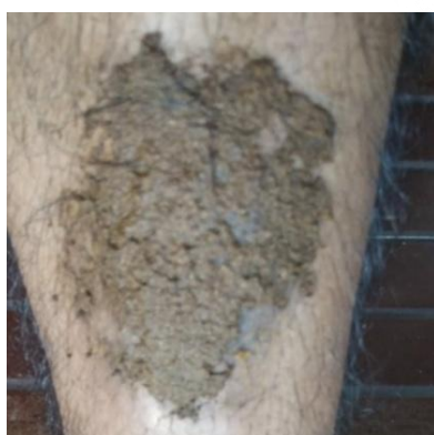
Photo of Panchnimbadi Lepa Application on Affected Area

Jalauka was applied on the affected area on 7, 14, 21 and 28 th day of the treatment. The affected area was cleaned. Jalauka were applied on the area and was allowed to suck blood until it left the site of its own. Turmeric powder was applied and the dressing was done. The blood sucked by Jalauka was collected and measured. Approximately 5ml of blood was sucked by it every time.