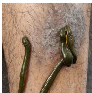
Photo of Jalauka Application on the Affected Area