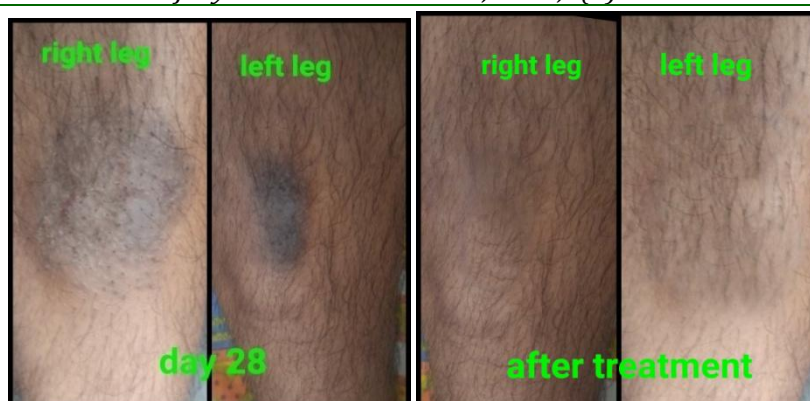
Table 5: Daily treatment regimen