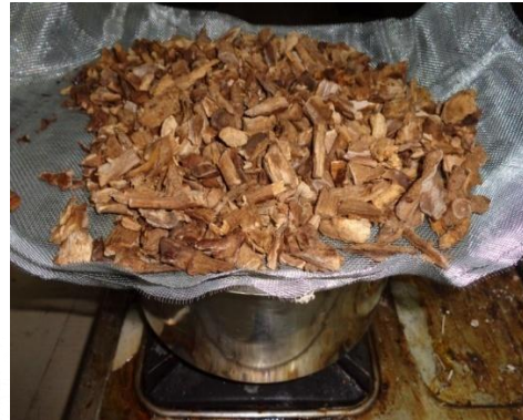
Figure 5: Colour change of Ashwagandha root