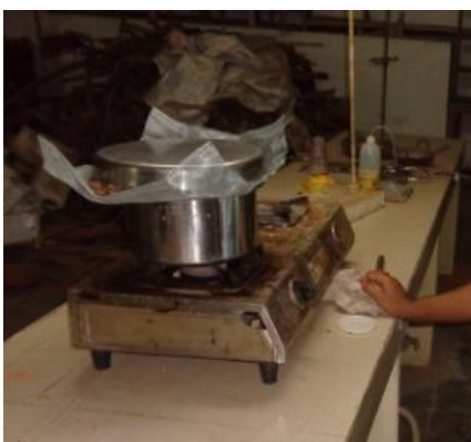
Figure 7: Process of doing Swedana of Ashwagandha

Swedana of Ashwagandha root with milk vapour, Then it is continuously boiled for about 1 hr on Mandagni . This vessel is closed by steel plate so that the vapors will not go out. This is done until hard pieces of Ashwagandha becomes soft.