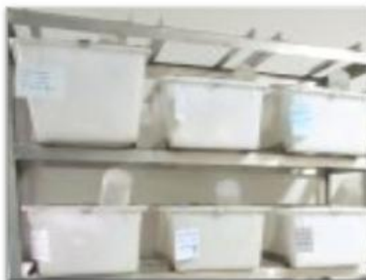
Figure 10: Showing cages of Experimental animals