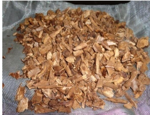
Figure 8: Purified wild variety of Ashwagandha