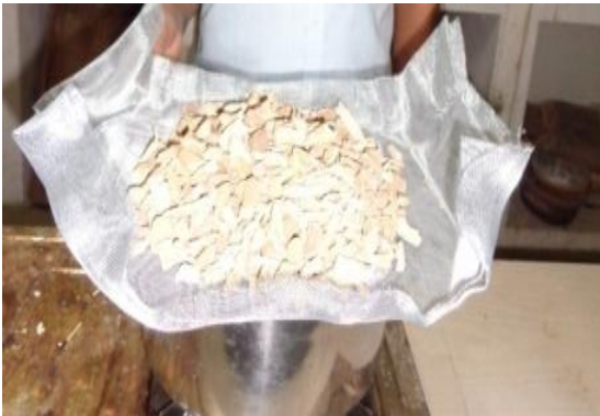
Figure 4: Swedana of Ashwagandha root

After that mesh is placed on the vessel. Over this mesh pieces of Ashwagandha are kept for purification.