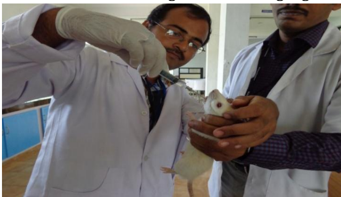
Figure 11: Showing Drug administration in animals