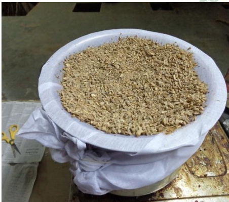
Figure 6: Swedana of Ashwagandha by using a clean cloth

Swedana of Ashwagandha root with milk vapour, Then it is continuously boiled for about 1 hr on Mandagni . This vessel is closed by steel plate so that the vapors will not go out. This is done until hard pieces of Ashwagandha becomes soft.