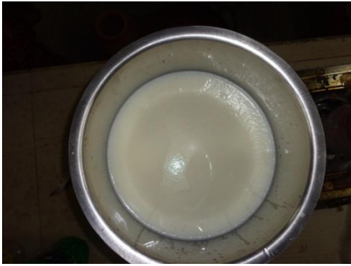
Figure 2: Gokshira