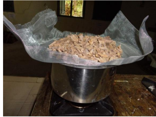
Figure 3: Swedana of Ashwagandha

After that mesh is placed on the vessel. Over this mesh pieces of Ashwagandha are kept for purification.