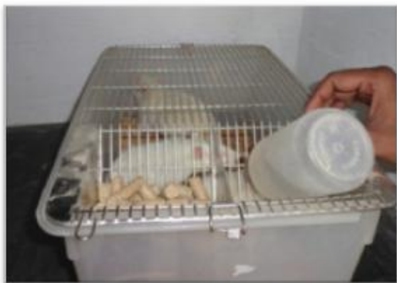
Figure 9: Showing Experimental Animals