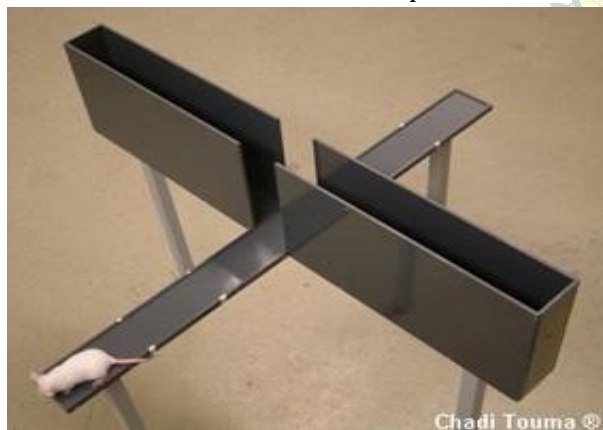
Figure 14: Elevated Plus Maze Model

The elevated plus maze is a widely used behavioral assay for rodents and it has been validated to assess the anti-anxiety effects of pharmacological agents and steroid hormones, and to define brain regions and mechanisms underlying anxiety-related behavior. Briefly, rats or mice are placed at the junction of the four arms of the maze, facing an open arm, and entries/duration in each arm are recorded by a video-tracking system and observer simultaneously for 5 min. Other ethological parameters (i.e., rears, head dips and stretched-attend postures) can also be observed. An increase in open arm activity (duration and/or entries) reflects anti-anxiety behavior. In our laboratory, rats or mice are exposed to the plus maze on one occasion; thus, results can be obtained in 5 min per rodent. [8]