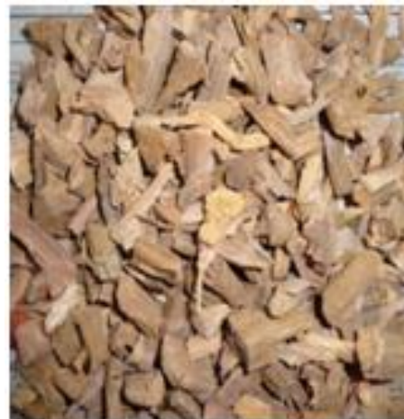
Figure 1: Pieces of wild variety of Ashwagandha