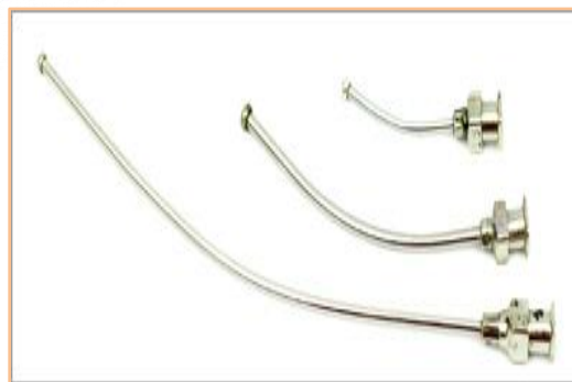
Figure 13: Showing Rat Oral feeding needles