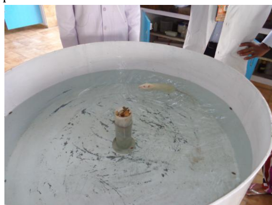
Figure 15: Showing Morris Water Maze Model

The Morris water maze (MWM) is a test of spatial learning for rodents that relies on distal cues to navigate from start locations around the perimeter of an open swimming arena to locate a submerged escape platform. Spatial learning is assessed across repeated trials and reference memory is determined by preference for the platform area when the platform is absent. Reversal and shift trials enhance the detection of spatial impairments. Trial-dependent, latent and discrimination learning can be assessed using modifications of the basic protocol. Search-to-platform area determines the degree of reliance on spatial versus non-spatial strategies. Cued trials determine whether performance factors that are unrelated to place learning are present. Escape from water is relatively immune from activity or body mass differences, making it ideal for many experimental models. The MWM has proven to be a robust and reliable test that is strongly correlated with hippocampal synaptic plasticity and NMDA receptor function. [9]