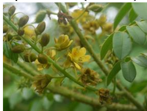
Fig 12: flowers and leaves of Caesalpinia Bonducella

The common names of Caesalpinia Bonducella are fever nut, Bonduc nut. In Hindi it is known with the names Kankarej, Katikaranjana, and the Sanskrit name is Kuberakshi, Its flowers and leaves are shown in figure 12. Caesalpinia bonducella belonging to Family Caesalpinaceae . The plant Caesalpinia bonducella (syn: Caesalpinia Crista Linn.) has been used in different system of traditional medication for the treatment of diseases and ailments of human beings. It is reported to contain various Alkaloids, Glycosides, Terpenoids and Saponins. It has been reported as anti-asthmatic, antidiabetic, anti-inflammatory, anti-oxidant, anti-bacterial, anti-filarial, anti-tumor, anxiolytic, immunomodulatory, hypoglycemic activity.