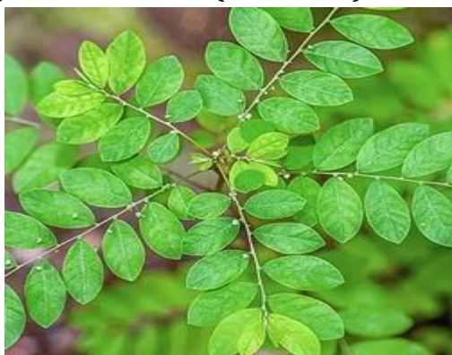
Figure 11: Leaves of Phyllanthus amarus

It is herb of height up to 60 cm, from family Euphorbiaceae . It is commonly known as Bhuiamala. Its leaves are shown in figure 11. It is scattered throughout the hotter parts of India, mainly Deccan, Konkan and south Indian states. Traditionally it is used in diabetes therapeutics.