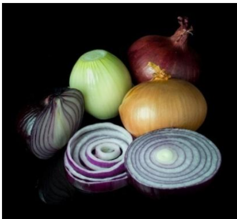
Figure 7: bulb of onion

The onion ( Allium cepa L.) also known as the bulb onion or common onion, is a vegetable and is the most widely cultivated species of the genus Allium shown in figure 7. Onions contain photochemical compounds such as phenolic that are under basic research to determine their possible properties in humans. There are considerable differences between onion varieties in polyphenol content.