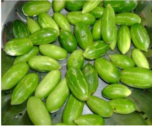
Figure 15: Fruits of Coccinia indica