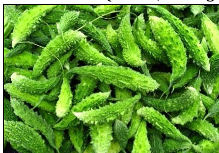
Figure 3: The fruits of Momordica Charantia