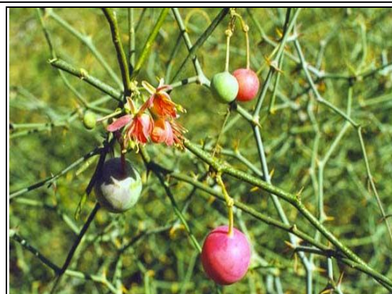
Figure 14: Plant and seed of Capparis deciduas

Capparis deciduas is commonly known as kair , kerda , karir , kirir , karril , etc. The plant and its seed are shown in figure 14. This is a useful plant in its marginal habitat. Its spicy fruits are used for preparing vegetables, curry and fine pickles and can attract helpful insectivores; the plant also is used in folk medicine and herbalism. Capparis deciduas can be used in landscape gardening, afforestation and reforestation in semi desert and desert areas; it provides assistance against soil erosion. Capparis deciduas is belonging to family Capparidaceae, yet important medicinal plant of Indian Medicinal Plants. In the traditional system of medicine, the bark has been shown to be useful in the treatment of coughs, asthma and inflammation; roots used in fever and buds in the treatment of boils. In Unani, leaves act as appetizer, helps in cardiac troubles, fruits used in biliousness. The plant is reported to contain Phytochemicals including alkaloids, terpenoids, glycosides and some fatty acids. Root bark is used as anthelmintic and purgative. The plant have significant pharmacological activities like hypercholesterolemic, anti-inflammatory and analgesic, antidiabetic, antimicrobial, antiplaque, antihypertensive, antihelmintic & purgative activities.