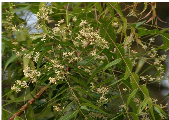
Figure 5: Flowers and leaves of Azadirachta Indica

Source of Neem is Azadirachta indica of family Maliaceae . The Flowers and leaves of Neem are shown in figure 5. The provisional naming was nimbin (sulphur-free crystalline product with melting point at 205 °C), nimbinin (with similar principle, melting at 192 °C), and Nimbidin (cream-coloured containing amorphous sulphur, melting at 90–100 °C). Nimbidin is as the main active antibacterial ingredient, and the highest yielding bitter component in the Neem oil. The neem leaf extracts and seeds are used as an active ingredient as an effective cure for diabetes. It has been scientifically proven after a number of tests and research by leading medical institutes, that Neem parts have high efficacy in treating the disease. Natural Neem tablets are being manufactured and exported the world over for treating large number of patients. Neem leaf extracts improve the blood