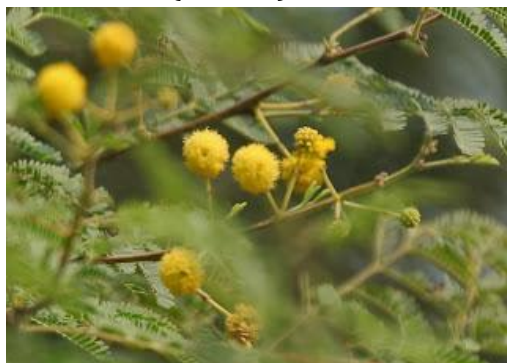
Figure 13: Flowers and leaves of Babul

The local name of the plant is bahul also commonly named as acacia from family Leguminosae, Its flowers and leaves are shown in figure 13. The different plant parts are used for therapeutic purpose as leaves, Seed, Bark and gum. Acacia gum contains chiefly arabin which is the mixture of calcium, magnesium and potassium salts of arabic acid. On hydrolysis arabic acid yields L-rhamnophyranose, galactopyranose, L-arabofuranose and the aldobionic acid, 6-d-glucuronosido-d-galactose. Further hydrolysis yields L-arabinose, D-galactose, d-glucuronic acid and rhamnose. The gum also possesses enzymes like oxidases, peroxidases and pectinases. It is found all over India mainly in the wild habitat. The plant extract acts as an antidiabetic agent by acting as secretagogue to release insulin. It induces hypoglycemia in control rats but not in alloxanized animals. Powdered seeds of Acacia arabica when administered (2,3 and 4 g/kg bodyweight) to normal rabbits induced hypoglycemic effect by initiating release of insulin from pancreatic beta cells. [21]