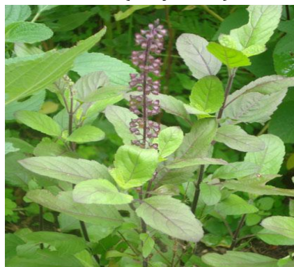
Figure 10: Leaves and flowers of holy basil