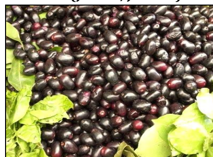
Figure 4: Fruits of Jamun

Syzygium cumini commonly name as jambul, jambolan, jamblang, or jamun, is an evergreen tropical tree in the flowering plant family Myrtaceae. Syzygiumcumini is native to the Indian Subcontinent and adjoining regions of Southeast Asia, it is shown in Figure 4. The species ranges across