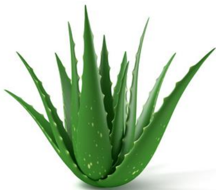
Figure 9: Aloe-Vera plant species