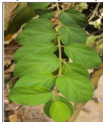
Figure 2: Leaves of Gymnema sylvestre

The common names include gymnema, Cowplant, Australian cowplant, gurmari, gurmarbooti, purmar, meshasringa , Bedki cha pala and miracle fruit. Gymnema sylvestre is an herb native to the tropical forests of southern and central India and Sri Lanka as shown in figure 2. Chewing the leaves suppresses the sensation of sweet. This effect is attributed to the eponymous gymnemic acids. G. sylvestre has been