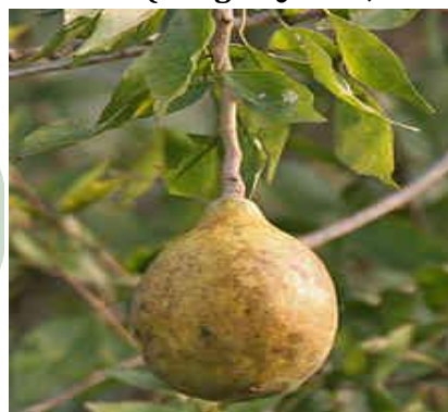
Figure 6: Fruit of Aegle marmelos

Aegle marmelos , commonly known as bael, Bengal quince, golden apple, stone apple, wood apple. It is a species of tree native to India, its fruit is shown in figure 6. It is present throughout Southeast Asia as a naturalized species. Its fruits are used in traditional medicine and as a food throughout its range. Bael is the only member of the monotypic genus Aegle . It is a mid-sized, slender, aromatic, armed, gum-bearing tree growing up to 18 meters tall. It has a leaf with three leaflets. The bael fruit has a smooth, woody shell with a green, gray, or yellow peel. Aegeline (N-[2-hydroxy-2-(4-methoxyphenyl) ethyl]-3-phenyl-2-propenamamide) is a known constituent of the bael leaf and consumed as a dietary supplement for a variety of purposes. Administration of aqueous extract of leaves improves digestion and reduces blood sugar and urea, serum cholesterol in alloxanized rats as compared to control. Along with exhibiting hypoglycemic activity, this extract also prevented peak rise in blood sugar at 1hr in oral glucose tolerance test. [14]