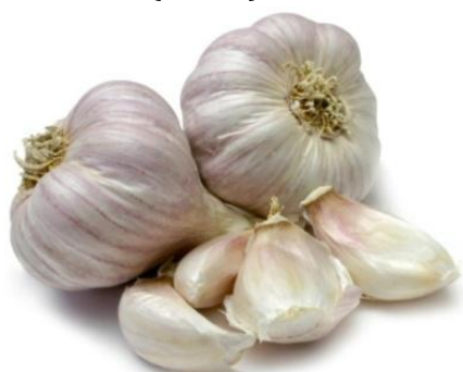
Figure 8: Bulbs of Allium sativum

Allium sativum , commonly known as garlic, and it is shown in figure 8. It is a species in the onion genus, Allium . Its close relatives include the onion, shallot, leek, chive, and rakkyo. Fresh or crushed garlic yields the sulphur containing compounds alliin, ajoene, diallylpolysulfides, vinylthiins, S-allylcysteine, and enzymes, saponins, flavonoids, and Maillard reaction products, which are not sulfur-containing compounds. The composition of the bulbs is approximately 84.09% water, 13.38% organic matter, and 1.53% inorganic matter, while the leaves are 87.14% water, 11.27% organic matter, and 1.59% inorganic matter.