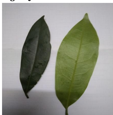
Fig 2: Leaves of Quassia indica Gaertn