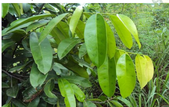
Fig 1: Quassia indica Gaertn

The fresh leaves of Guchakaranja ( Quassia indica Gaertn) were collected from the Puthiyakavu locality of Tripunithura. The sample was identified as genuine by the Pharmacognostic studies, conducted in the department of Dravyaguna Vijnanam , Government Ayurveda College, Tripunithura, Kerala. The leaves were washed with water thoroughly to remove physical impurities like soil, mud etc., and then chopped and dried well in sun. It was then powdered and kept in airtight containers. The Phytochemical analysis was done at Drug standardization unit of Department of Dravyaguna Vijnanam , Government Ayurveda College, Tripunithura, Kerala.