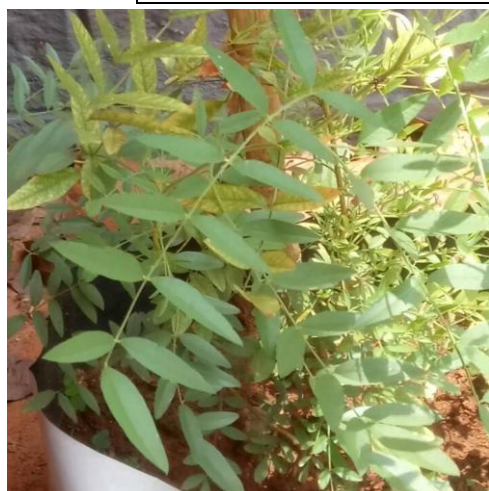
Fig 1. Glycyrrhiza glabra Linn