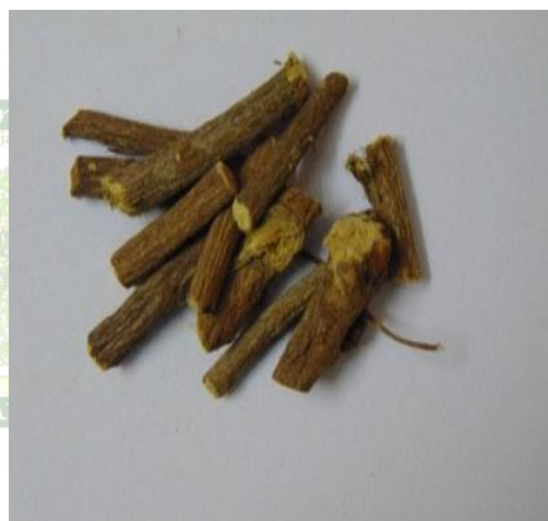
Fig 2. Root of Glycyrrhiza glabra Linn