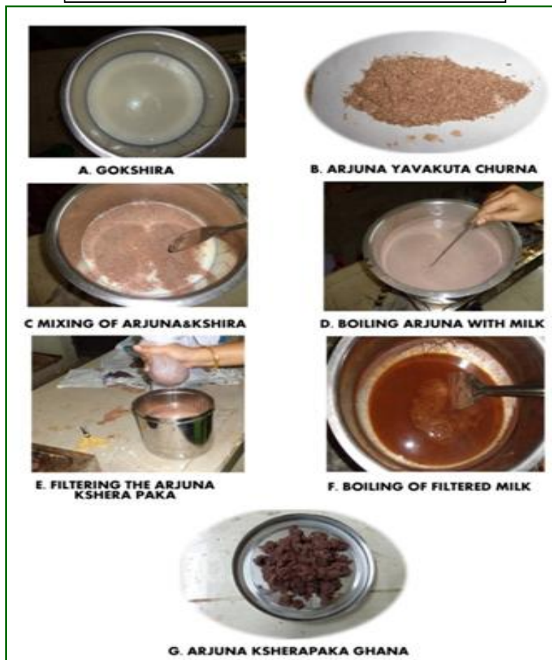
Fig.1 PREPARATION OF ARJUNA KSHEERAPAKA