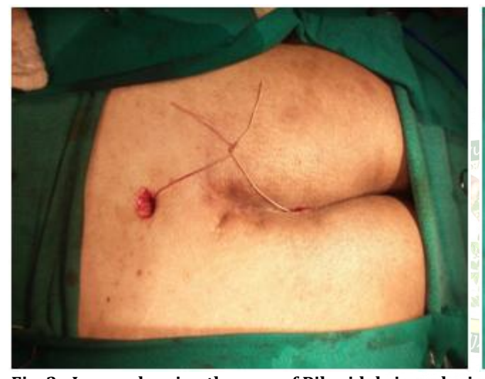
Fig. 3 - Image showing the case of Pilonidal sinus during surgery