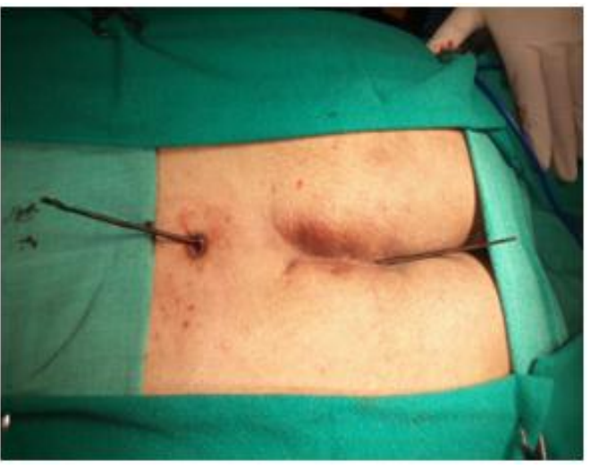
Fig 2 - Image showing the case of Pilonidal sinus during probing