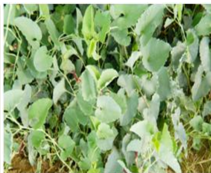
Fig: 2. Aristolochia bracteolata