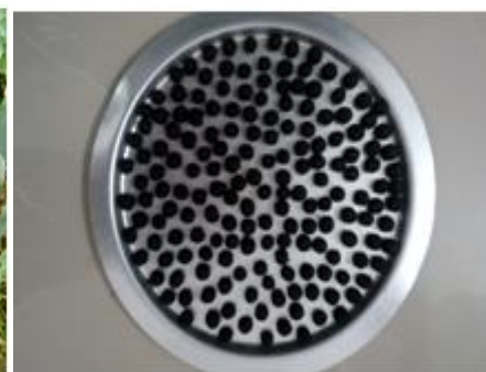
Fig: 3. Naaval Kottai Mathirai