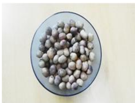
Fig: 1. Syzygium cumini seed