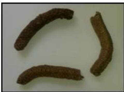
Market Sample of Jaipur S (4)