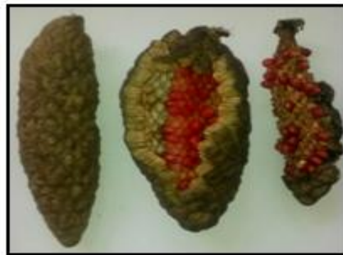
Genuine sample of Odisha S (1a)