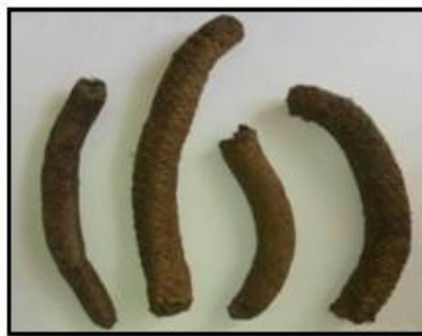
Market Sample of Haridwar S (3)