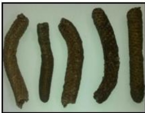
Market Sample of Delhi S (2)