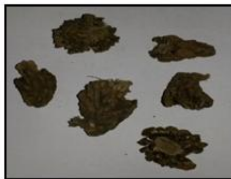
Market Sample of Odisha S (5)