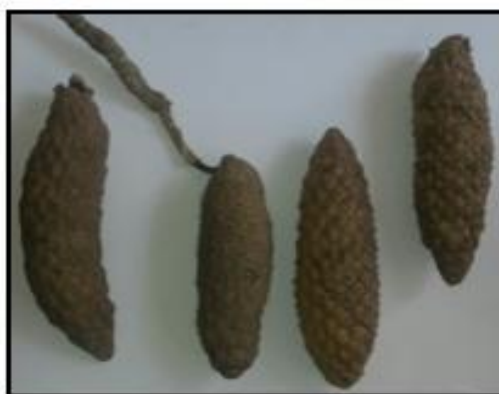
Genuine sample of Uttarakhand S (1b)