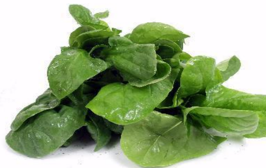
Figure 1: Spinach leaves