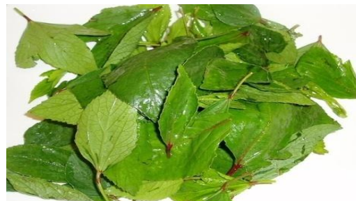
Figure 2: Sorrel leaves