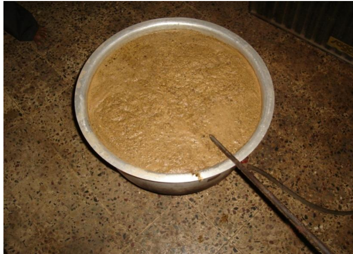
Figure 2. Preparation of Kandughna taila