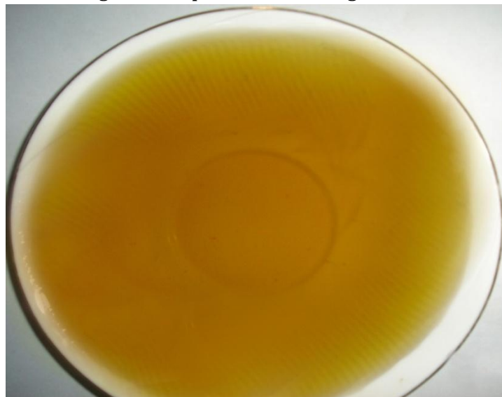
Figure 3. Bowel with Kandughna taila