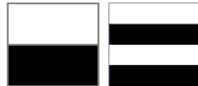
Figure (2): Images having same color proportions but, different spatial distribution [12].

shown in figure 2 have the same color proportions but different spatial distribution. Correlation histogram (correlogram) tries to fix this histogram's drawback by taking the spatial correlation of color distribution into account, and shows how the spatial correlation between pairs of colors is changing with distance [13].